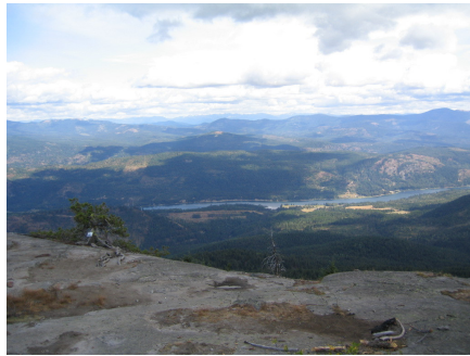
View #2: View from Granite Mt.