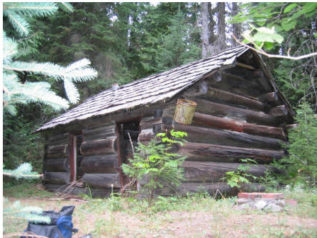
View #1: Cabin on the trail