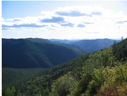
View #2: Toward Silver Creek

History: Silver Creek Road begins at Leadpoint on the Deep Lake-Boundary road. The ridge to the south of this canyon is the Electric Point mining area which in 1918 was the biggest lead producer in Washington State. The nearby Gladstone mine had some silver content which may have led to the creek's name.