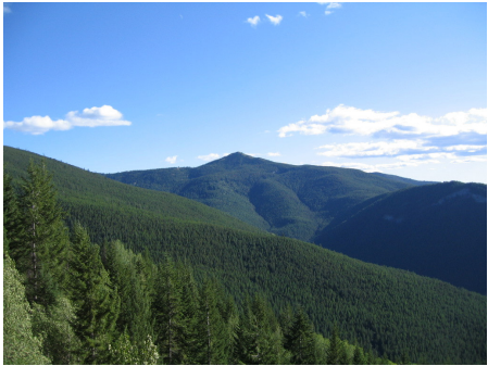
View #1: Toward Linton Mt