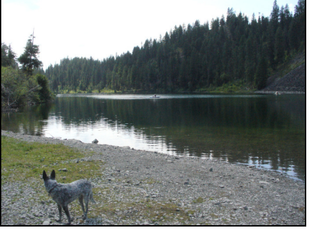
North End of Long Lake