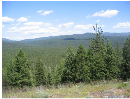
View #2: From Top of Butte

History: In 1939, most Refuge lands were acquired through the Resettlement Administration which retired marginal farmland. The Washington Dept. of Wildlife managed the Refuge for the US Fish and Wildlife from 1965 to 1994 after which US Fish and Wildlife resumed control.