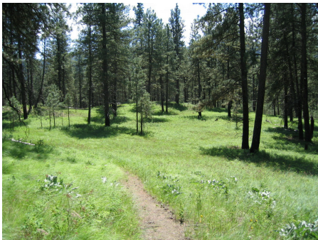
View #1: Section of Trail