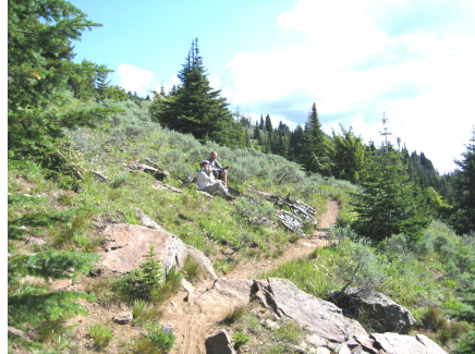
View #2: Section of Trail

History: The Kettle Range is older than the Cascade or Olympic Mountains and was once much higher. Part of it slipped to the east becoming the Huckleberry Range. To the west a crack in the earth's mantle allowed igneous rock, both volcanic and intrusive to rise to the surface bringing rich mineral deposits.