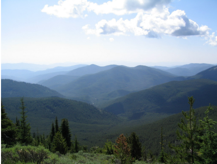
View #1: View along the Crest