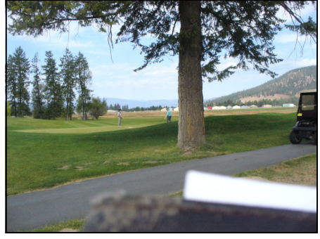
View from the parking area