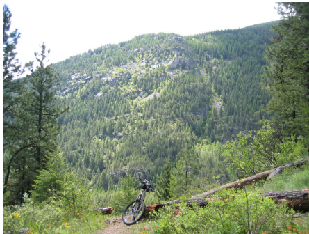
View #1: Coyote Mt.