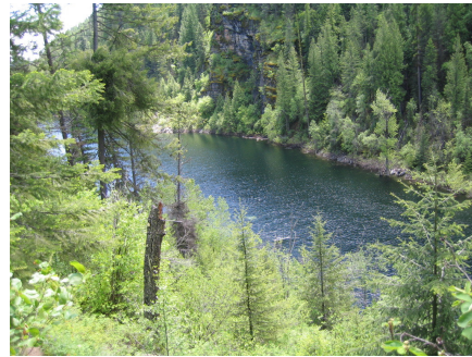
View #2: Emerald Lake