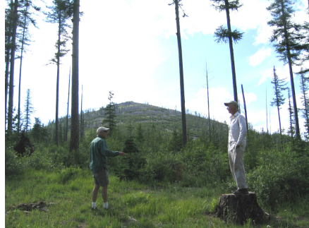
View #2: Near the top

History: Also known as “The Trail to Hell”, Thirteenmile Trail is renowned as one of the most scenic and least spoiled trails in the Kettle Range. At the bottom it travels through volcanic rock cliffs and pine forest. At the top it passes through ocean floor rocks and on to pure granite in a fir and spruce forest.