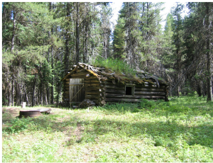
View #1: Old Miners Cabin