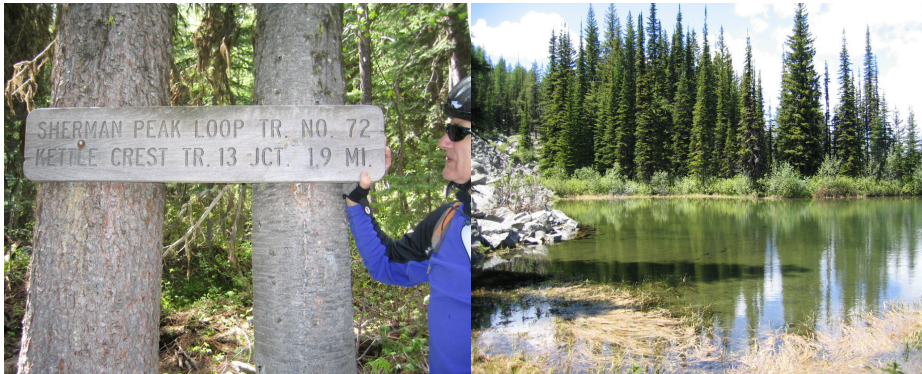
View #1: Junction with #13