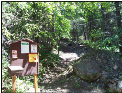
Sherlock Peak Trailhead