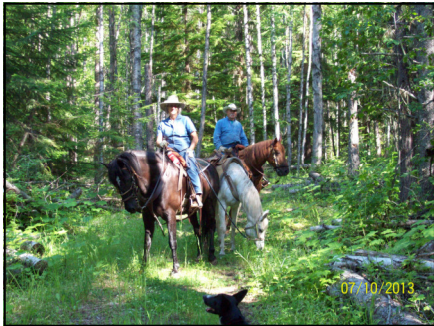
Horseback travel is welcome