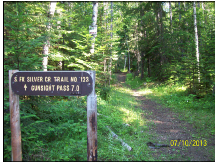
S. Fk Silver Cr and Gunsight Pass