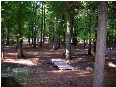
View #1: Bridge