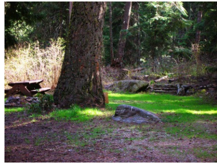
View #2: Picnic Table

History: 440 acres were donated by citizens in the 1920's to the State for this park.. The county took over in the early 1980's. Back Country Horsemen maintained it for forestry contests, archery and horseback riding. Volunteers including school and church groups and a jail crew improved trails in the 2000's and named the trails mostly for plants. Veronica's Prom trail got its name from a purple prom dress found in a tree.