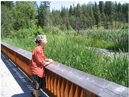
View #1: Wetlands from Walkway