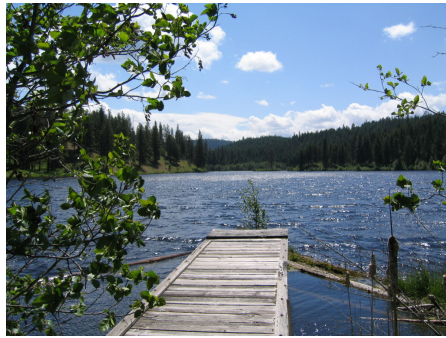
View #2: McDowell Lake

History: In 1939, most Refuge lands were acquired through the Resettlement Administration which retired marginal farmland. The Washington Dept. of Wildlife managed the Refuge for the US Fish and Wildlife from 1965 to 1994 after which US Fish and Wildlife resumed control.