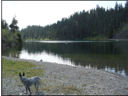
South End of Long Lake