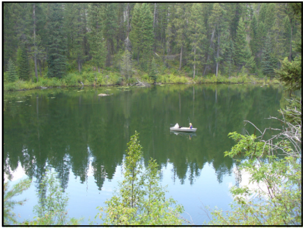
North End of Long Lake