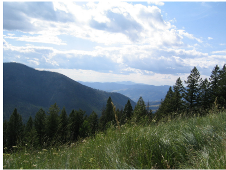
View #2: Kettle Crest View