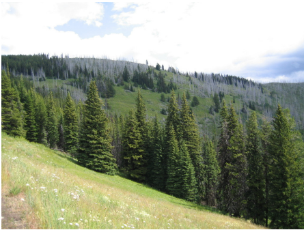
View #1: Copper Mt Fire