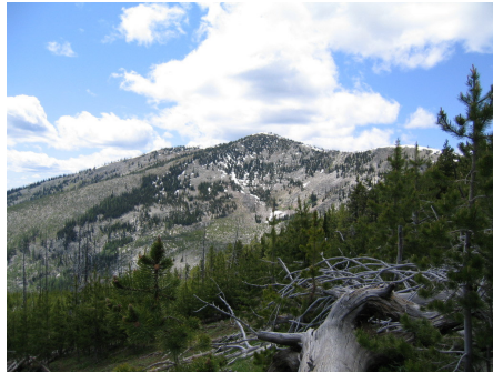
View #2: White Mt Fire