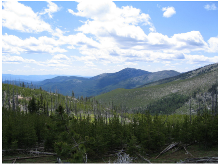
View #1: South Kettle Crest Trail