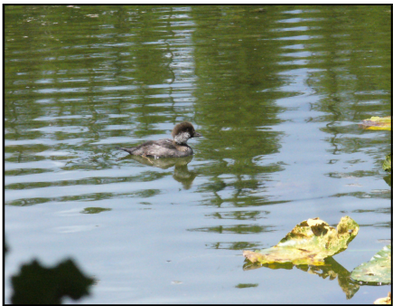
View from Trail, South End