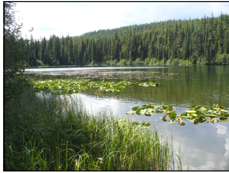
View from Trail, North End