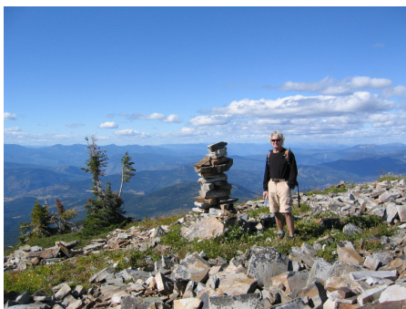
View #2: Pend Oreille Valley