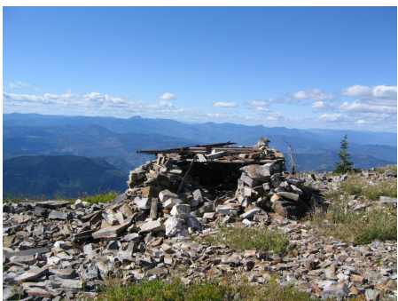
View #1: Remains of old fire tower